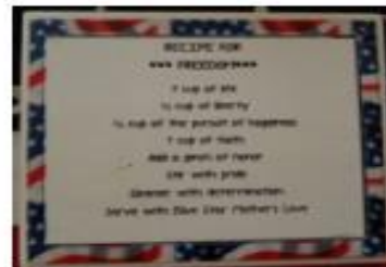
Recipe for Freedom # ____ @ $5.00

Name _____ Mailing Address _____ Phone _____ Email _____ S&H: $5-$20 $5 _____ $21-40 _____ $41+ $15 _____