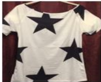
Off Shoulder Casual T Shirt Short Sleeve Loose Fit Lg ____ XL ____ 2XL ____ # ____ @ $25.00