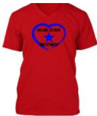
Blue Star Mother - 1 Star $23.99