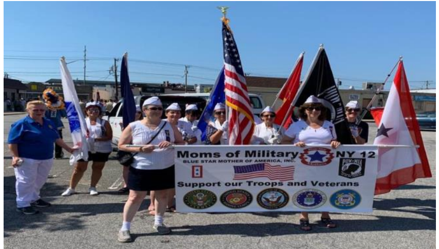
Moms marching in the Wantagh July 4th Parade. We even won the Judges Spirit Award.