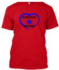
Blue Star Mother - 1 Star $23.99

https://teespring.com/stores/blue-star-mothers