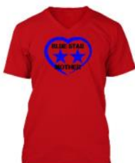
Blue Star Mother - 2 Star $23.99