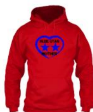
Blue Star Mother - 2 Star $38.99