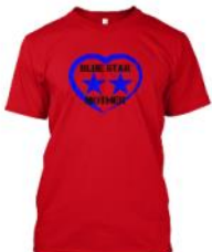
Blue Star Mother - 2 Star $23.99