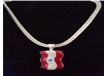
Silver Necklace 18" with One Star Service Slide # ____ @ $20.00