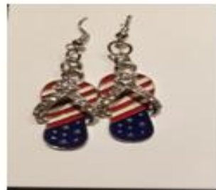
Flip Flop Earrings 1-1/4" # ____ @ $10.00