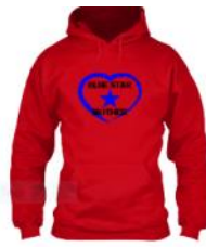
Blue Star Mother - 1 Star $38.99