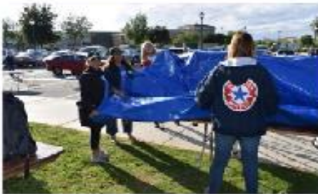
Blue Star mom morning shift!