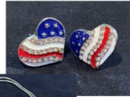
Item #4 Heart Necklace