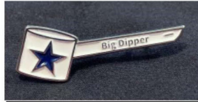
Item #6 Big Dipper Lapel Pin