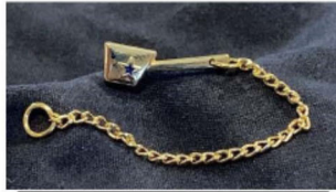
Item #1 Big Dipper Guard Pin