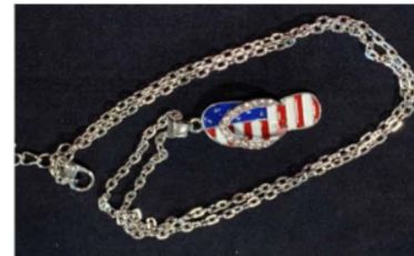
Item #13 Flip Flop Necklace