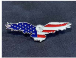
Item #2 Eagle Pin