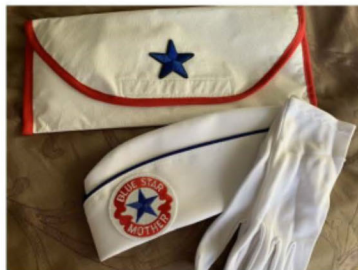
Item #14 Blue Star Hat Bag