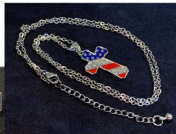
Item #12 Patriotic Cross Necklace