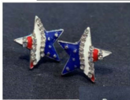
Item #8 Star Earrings