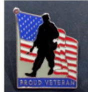
Item #7 Proud Veteran Pin