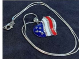
Item #5 Heart Earrings & Necklace Bundle