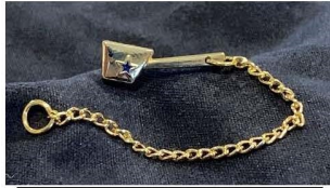
Item #1 Big Dipper Guard Pin