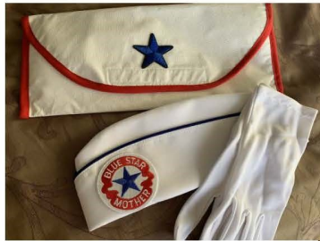
Item #14 Blue Star Hat Bag