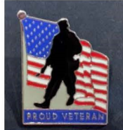
Item #7 Proud Veteran Pin