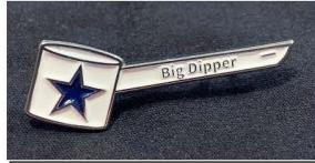
Item #6 Big Dipper Lapel Pin