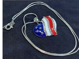
Item #5 Heart Earrings & Necklace Bundle