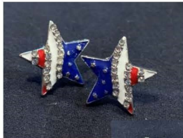
Item #8 Star Earrings