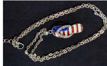
Item #13 Flip Flop Necklace