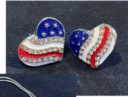
Item #3 Heart Earrings Item #4 Heart Necklace