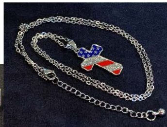
Item #12 Patriotic Cross Necklace