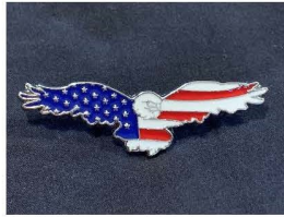
Item #2 Eagle Pin