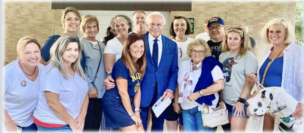
With featured speaker Rocky Bleier