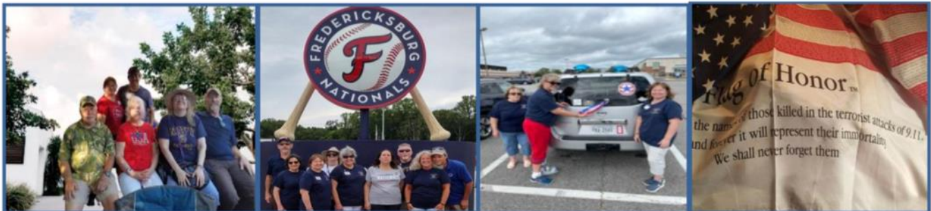
Fun outing at the Fredericksburg Area Museum outdoor concert enjoying the sounds of the Acoustic Onion Band playing Beatles tunes. A great time was had at the Fredericksburg Nationals Ball Park on Military Day. VA4 members paid tribute to those killed in the 9-11-01 terrorist attacks by parading through town in decorated cars as a reminder to our fellow Americans – WE WILL NEVER FORGET.