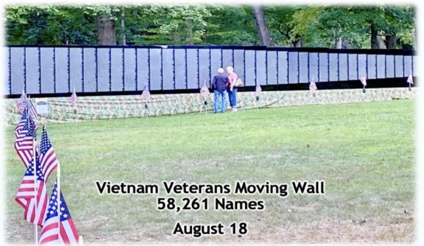
Vietnam Veterans Moving Wall 58,261 Names August 18