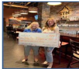
The VA4 members organizing donated items for the upcoming November Care Packing. Sedona Taphouse presented a $747 check for our Care Package Program.