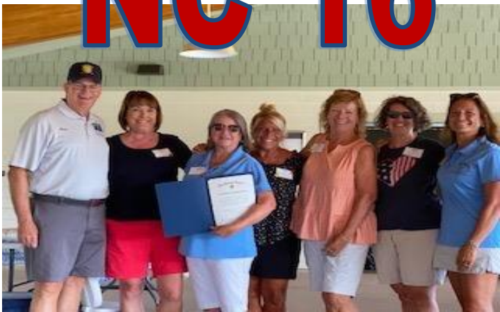
American Legion Event Above