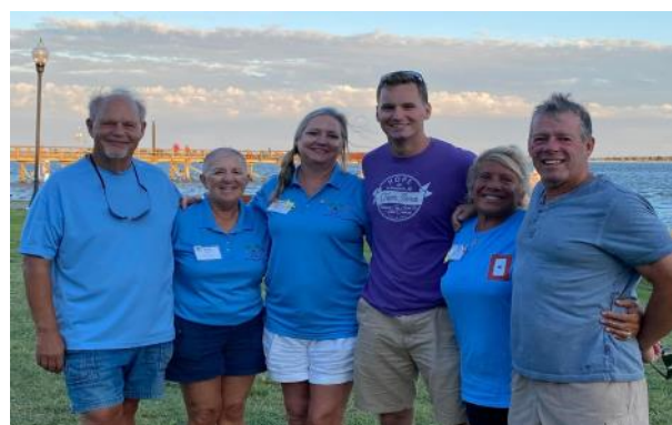
Flag Lowering Ceremony Below