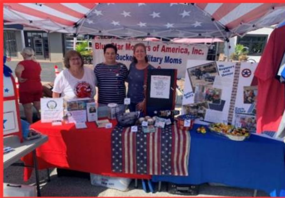
Old Hilliard Fest

Some of our members had quite a busy weekend in September. The weekend started with a military/veteran appreciation night at a local high school. Members separated and conquered Old Hilliard Fest , the Empty Pockets Cruisers Patriot's Day Car Show , and the Columbus Oktoberfest . The events are fun and a great