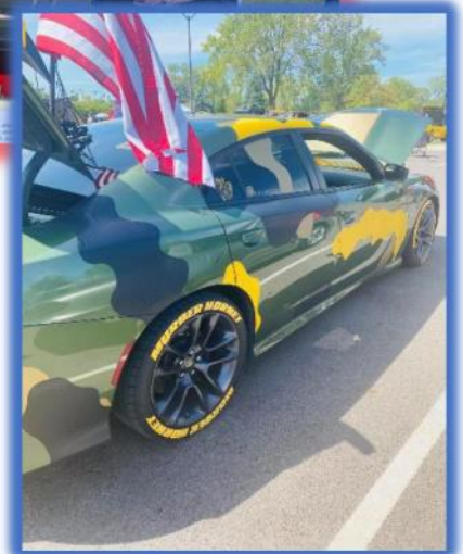
Patriot's Day Car Show