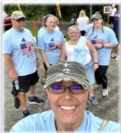
Mission Possible 5K Race benefitting City Mission's Veterans House August 6