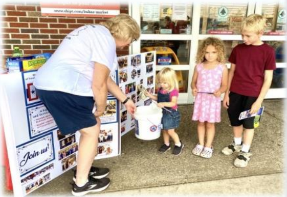
Gathering donations for care packages August 21