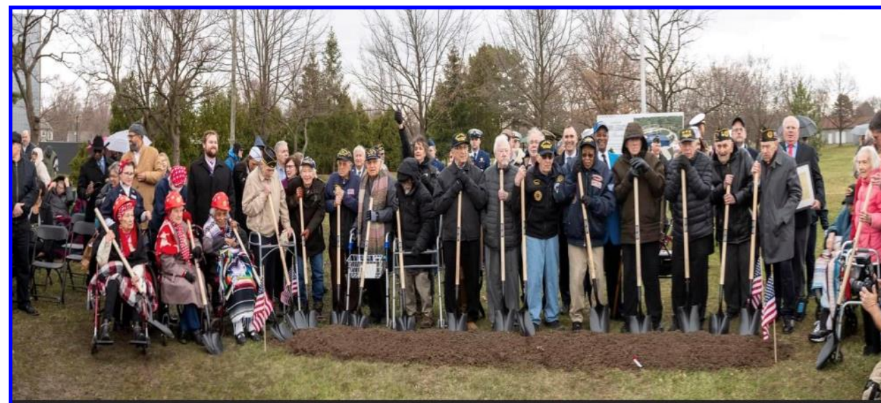
Red White & Blue Star Mothers MI 198

April 2 nd Red White & Blue Star Mothers MI-198 volunteered for an Easter Egg Hunt at Enlisted Heritage House on Selfridge Air National Guard Base in Harrison Twp, MI, to bring joy to military children and their families! The Easter Bunny was flown in on a Coast Guard helicopter! The kids enjoyed an Easter egg hunt, games, a petting zoo, pony rides, refreshments and even a surprise visit from T-Rex!