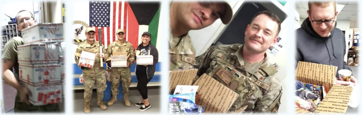
Some of our care packages were received in Kuwait

Monthly meetings: Mission BBQ Restaurant Robinson Township, PA