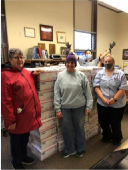
Donation of handmade pillow cases to be included in the care packages.

340 care packages were shipped which included adopting an entire Company in Romania.