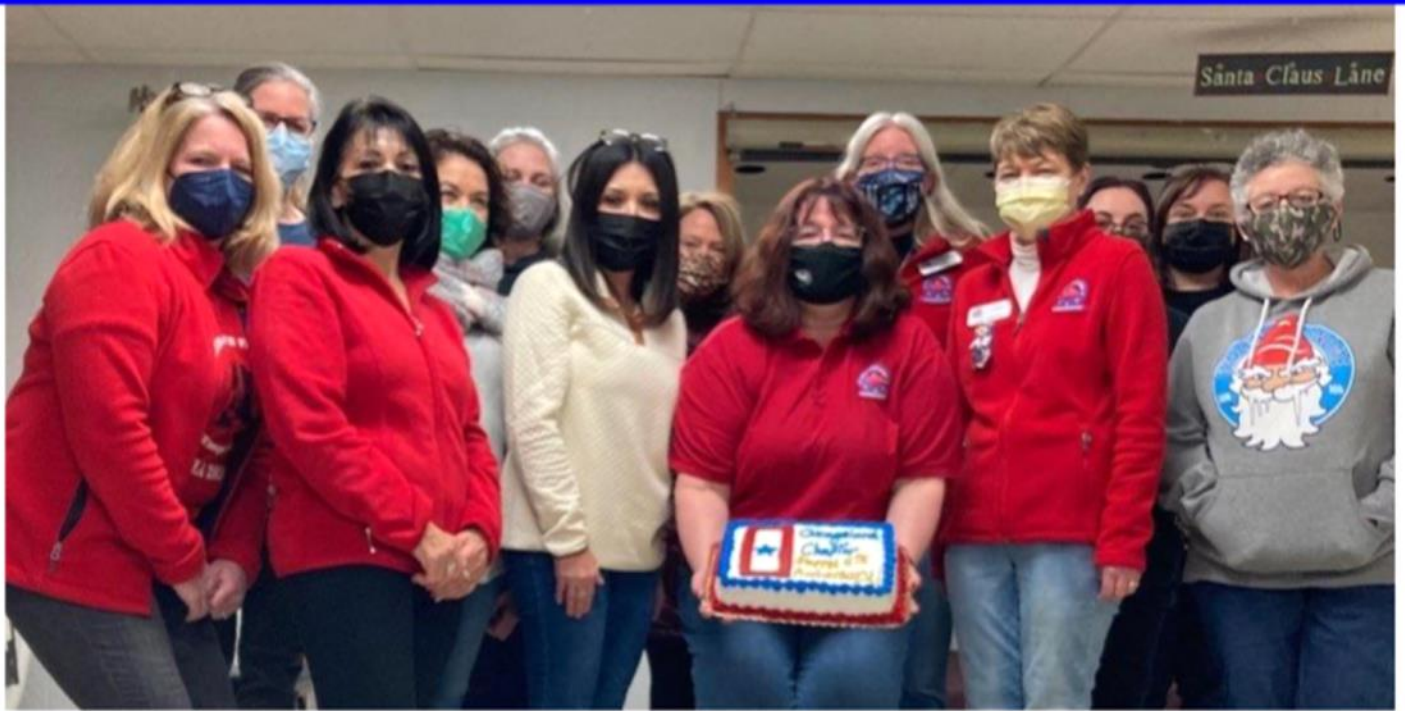
Chicagoland Blue Star Mothers IL6

Celebrating 6 years of service to our area, IL6 commemorates our 6 th anniversary of the chartering of our chapter in January. In February, to recognize all our local VFW Post 8081 does for us, we offer free desserts at their monthly fish fry for our veterans, their families, and friends. Everyone is always excited to see us there with our treats! Coming soon – a Girl Scout Cookie drive for our USOs, Military Appreciation Night at Chicago Steel Hockey, a collaboration with American Gold Star Mothers Dept. of Illinois, and more!