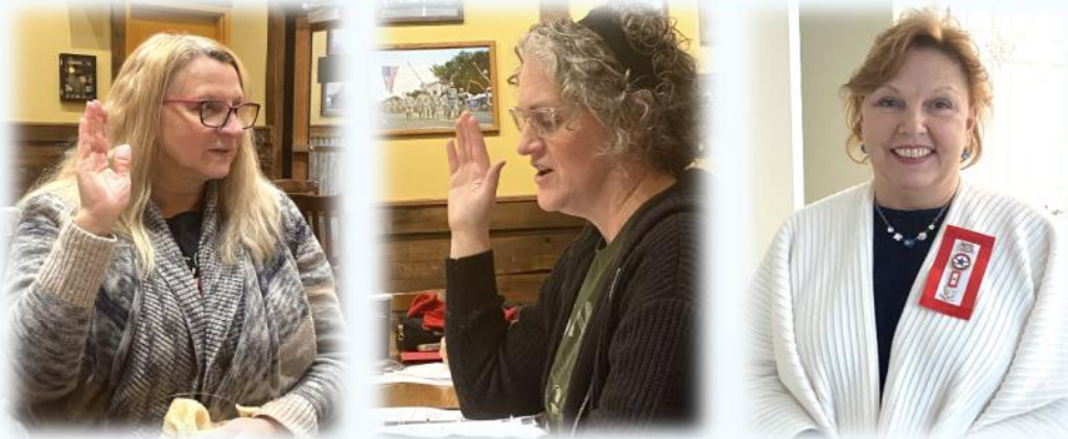
Snapshots from our January meeting