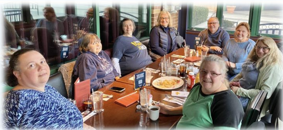
A few of our members having lunch at the Hard Rock Cafe