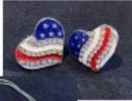
Item #3 Heart Earrings Item #4 Heart Necklace