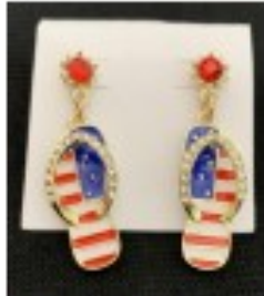
Item #14 Gold Flip Flop Earrings