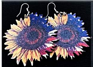
Item #15 Wooden Sunflower Earrings