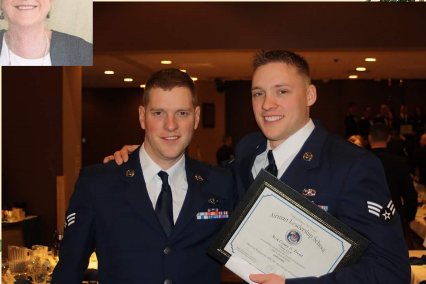
My 2 Veteran Air Force sons