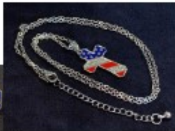
Item #11 Patriotic Cross Pin Item #12 Patriotic Cross Necklace