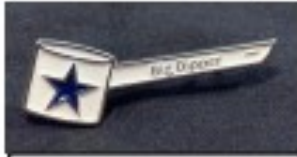
Item #6 Big Dipper Lapel Pin