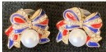
Item #16 Bow Earrings