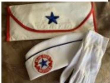
Item #17 Blue Star Hat Bag hat and gloves available through the National Online Store. The lining varies