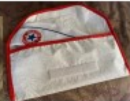
Item #18 Flag Knit Hat, cozy and warm