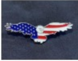
Item #2 Eagle Pin