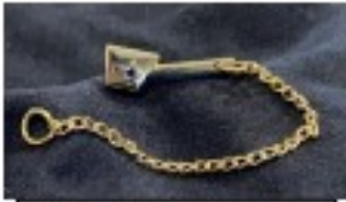
Item #1 Big Dipper Guard Pin