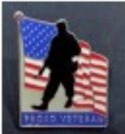
Item #7 Proud Veteran Pin