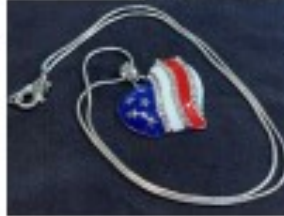
Item #5 Earrings and Necklace Heart Set