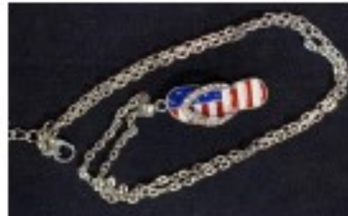
Item #13 Silver Flip Flop Necklace