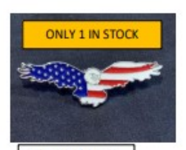
Item #2 Eagle Pin