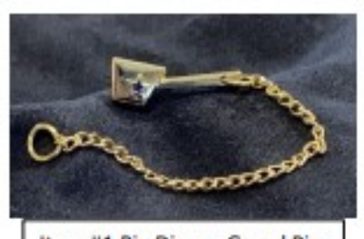
Item #1 Big Dipper Guard Pin