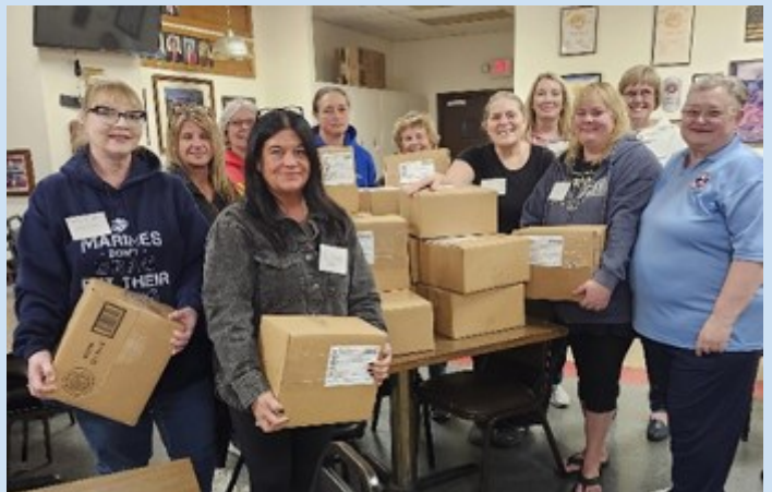
Fort Wayne Veterans Day Parade Care Packages Ready to Ship