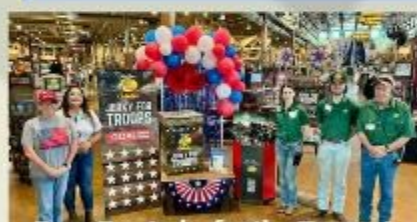
Bass Pro Jerky for the Troops!