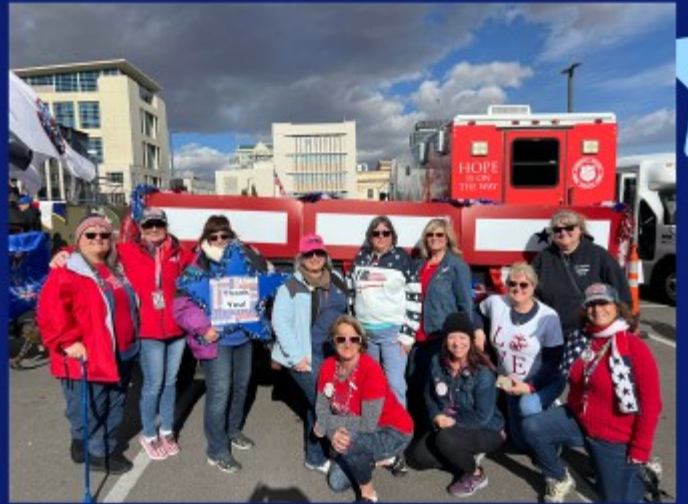
BSM float in Veteran's Day Parade