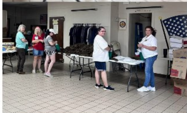
s News This Morning Page 2 Athens, Tennessee