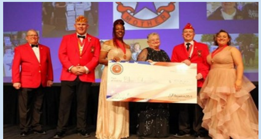
Marine Corp Birthday Ball and Check Presentation