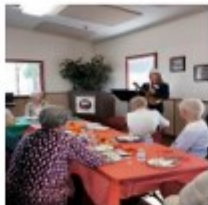
Our Chapter attended Blue Horizons Elementary School where they honored our Veterans and Active Duty with a wonderful program. The children decorated and signed hundreds of Holiday Cards for the chapter that were sent out with our December care packages. It was a wonderful event!