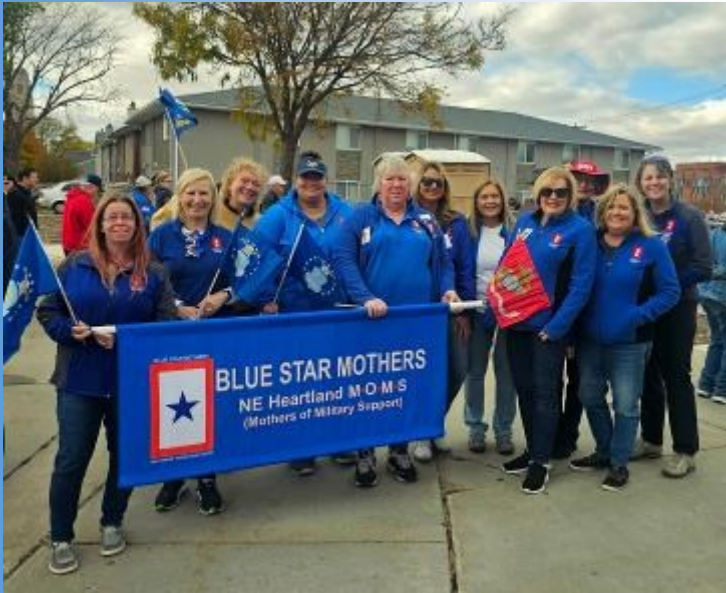
Veterans Day Parade November 2024

ALSO, IN OCTOBER, WE PARTICIPATED IN THE HAUNTED ARMORY FOR LOCAL MILITARY FAMILIES.