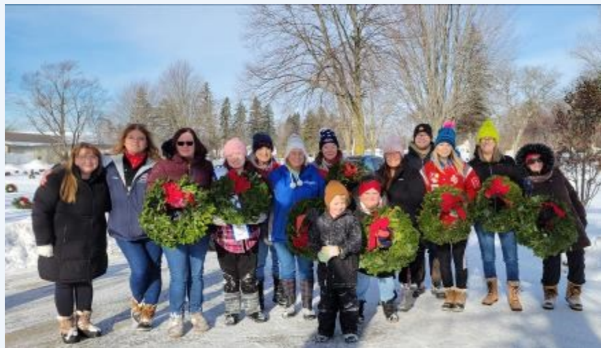
OH 57 and friends and family laying wreaths 2024 20