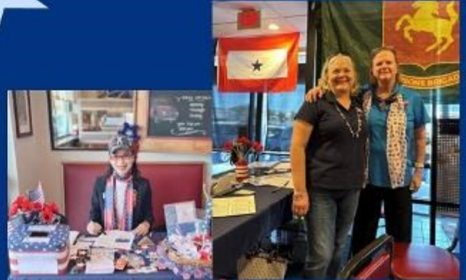
Honoring Veterans on Veterans Day