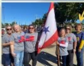
Little Elm Veterans Committee Walk and Ceremony