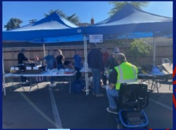
Booth at Stand Down