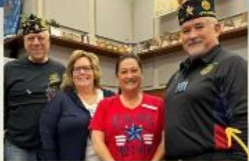
Celina Independent School District Veterans Program with our friends at the Celina American Legion Post.