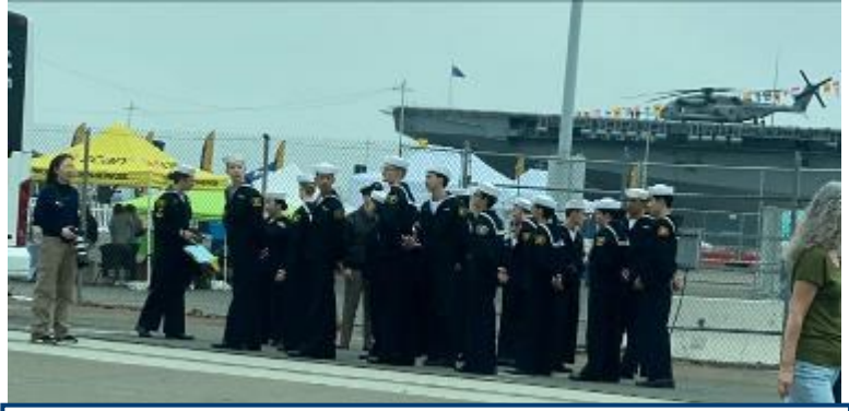
On Oct 13, CA15 and CA26 walked in the San Francisco Fleet Week parade. It was very uplifting to hear all the support we received by the crowds. "Thank you" was being shouted as we passed. Applauses too!