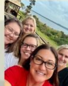
Board Retreat - lots of planning and FUN!