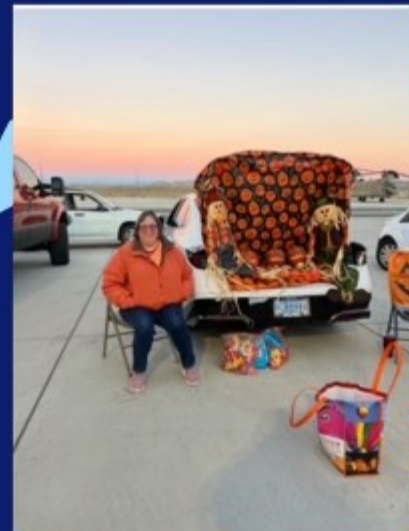
Choppers & Treats with the National Guard