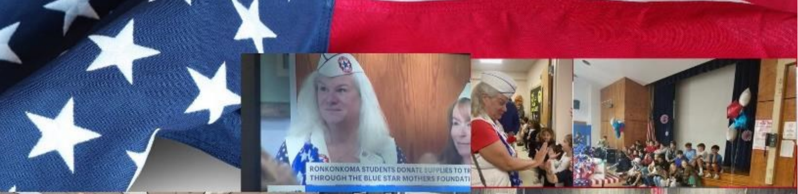
RONKONKOMA STUDENTS DONATE SUPPLIES TO THE THROUGH THE BLUE STAR MOTHERS FOUNDATI