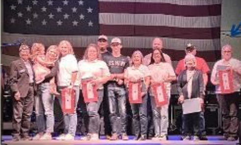
Our Blue Star Mothers were recognized at The Colony's Veterans Day Celebration.