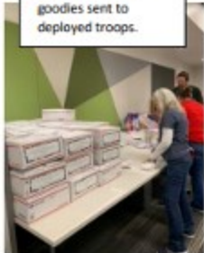
Our Chapter partnered with SRPVETS to include 21,000 baked or bought cookies in 93 packed boxes of goodies sent to deployed troops.