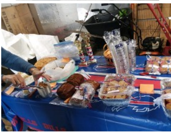
Baked Goods Contest