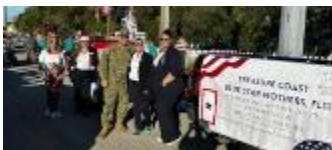
Treasure Coast Blue Star Mothers participated in the Fort Pierce "Color me Christmas" parade. One of our dads donned his uniform to be part of the float. Our theme was Packages from Home