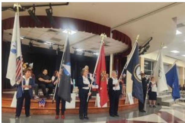
Our BSM carried the service flags at the Veterans Day Program