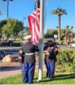
We represented our Chapter at the Marine Flag Raising Ceremony in Uitchfield Park. At the Floor and Décor Veteran Event we were joined with the American Legion and Rosie the Riveters.