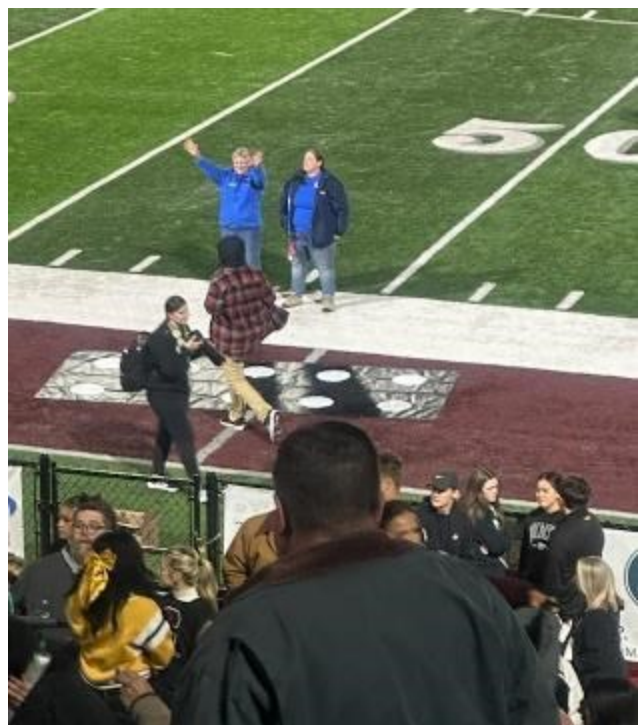
At halftime the cheerleaders did a donation run for our organization as we were honored during the game with all Veterans