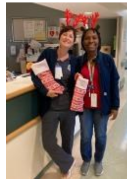
The Palm Beach VA Hospital gladly received our Christmas stockings for the residents on the Blind Wing