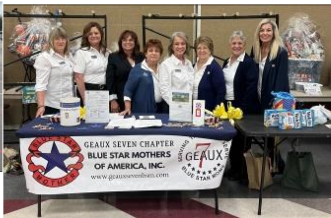
Geaux Seven BSM participated in the Veterans Day Program at the Central Middle School