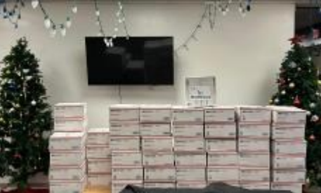
As our chapter project we have adopted a base off the coast that is very isolated. They invited our Chapter President and 1VP to attend their version of the Navy Ball. As a chapter we were honored to send them. Our President and 1VP came bearing gifts and a home cooked meal for the seamen there.