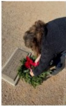
We participated in Wreaths Across America and two Veteran's Day Parades-Phoenix and Surprise.