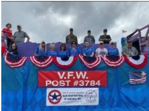
Geaux Seven Blue Star Mothers rode on the VFW Post #3784 float at the Veterans Day Parade in Walker, Louisiana