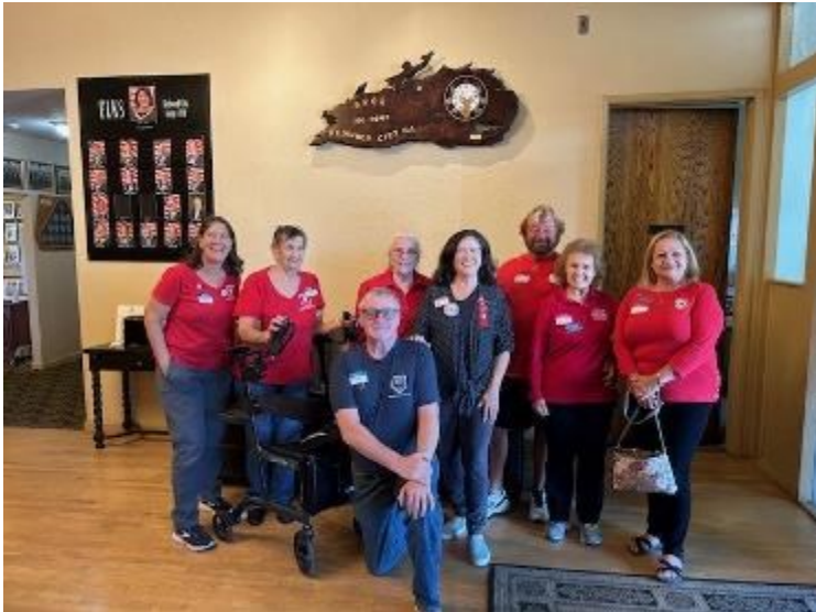
On Oct 19 our chapter joined forces with the Redwood City Elks Lodge in packing 450 boxes and over 100 bags for our local Veterans. This is the 2nd year in a row the Elks Lodge has hosted the event.