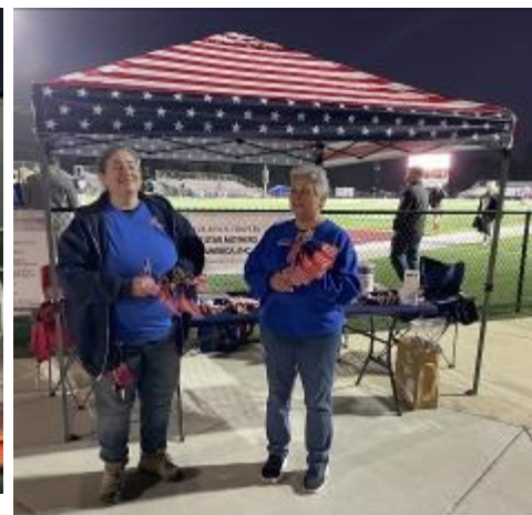
Geaux Seven BSM were honored at the Central High School Football Game November 22nd