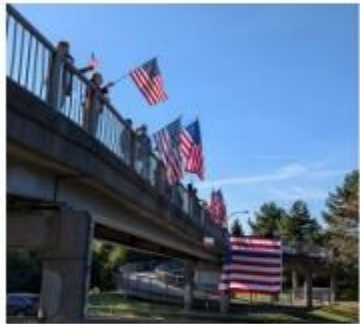
Annual remembrance of 9-11 with Flags on the Bridge