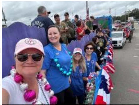
Our ladies had a great time participating in the Veterans Day Parade