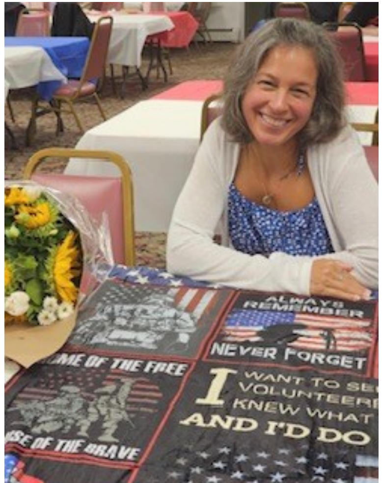
A recent pic from a Veteran Ceremony