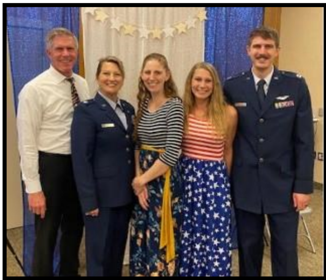
My marvelous USAF Family at my retirement!