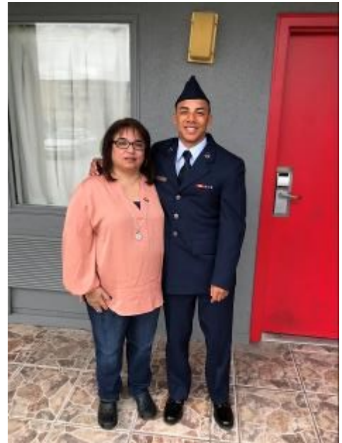
Feb 2020 his basic graduation