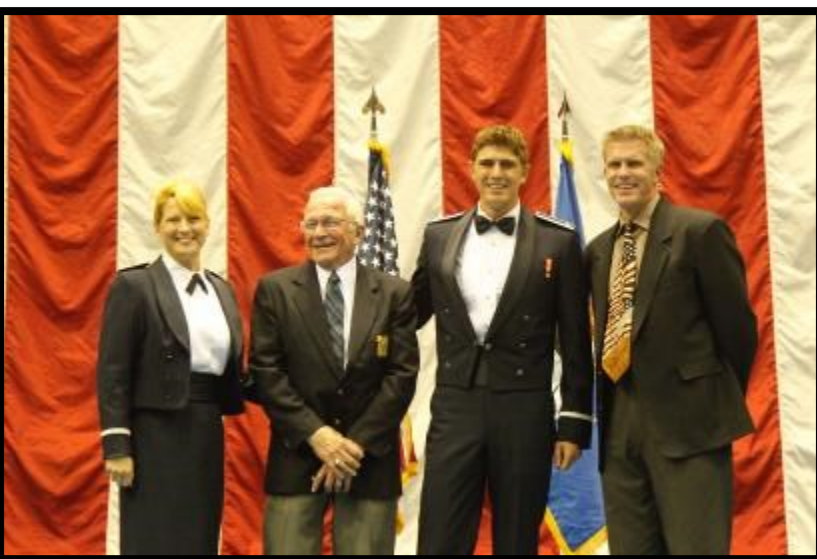
My son graduating from USAFA with USAF mom, dad and grandpa