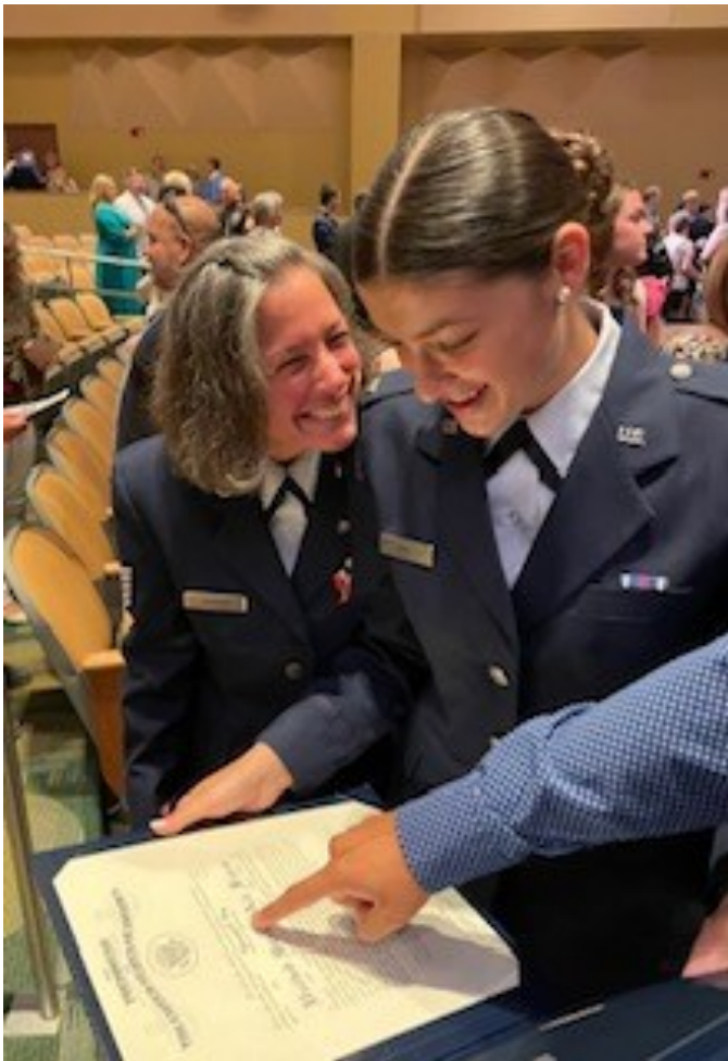
My daughter at my daughter's college, USF Commissioning Ceremony. First Salute

I would love to add that my daughter is 3rd Generation Military (3rd Gen Air Force on my side) and is the first to be an Officer on either side of the family tree. Her father and stepmother are also retired USAF.