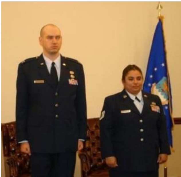
My Retirement 2010

I joined the military at the age of 21. I started out in Services which was originally food, lodging and mortuary. A few years later our squadron merged with fitness and recreation . I was stationed stateside most of my career with the exception of a short tour in Korea. I deployed 10 times throughout my career to Saudi, Kuwait, UAE, Mogadishu, and Italy. My favorite things I enjoyed most with my career was the traveling and the amazing people who I have crossed paths with. Most became family. I joined BSMA in 2022 a few years after my youngest son had entered the USAF. My son is currently deployed in Kuwait. I have one older son also. I am very proud of both of my boys