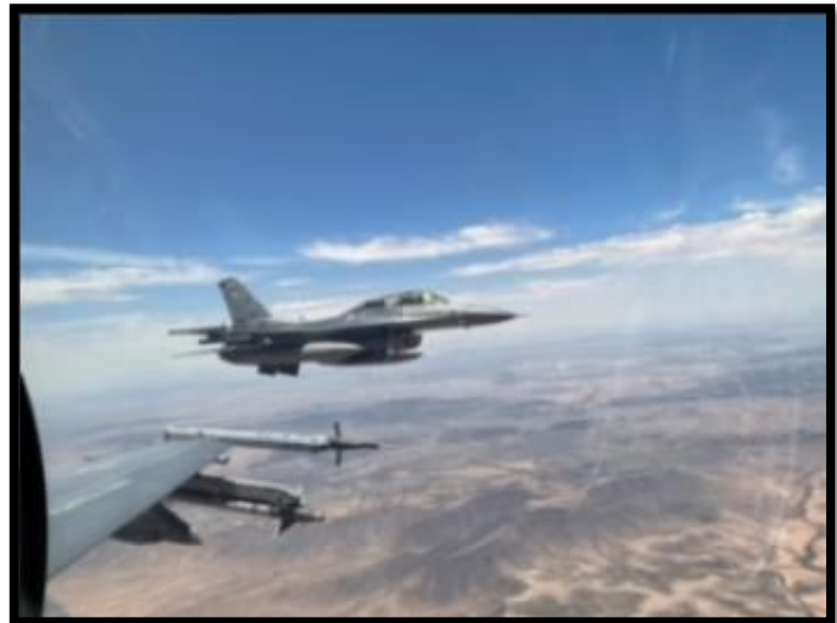
My son taking my picture when I got a ride in an F16