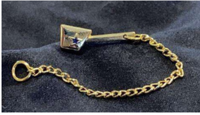
#1. Big Dipper Guard Pin $12.00