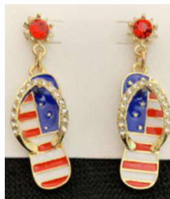
#14 Flip Flop Earrings $12.00 (gold tone)