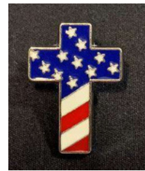
#9. Cross Pin $8.00