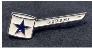
#2. Big Dipper Lapel Pin $12.00