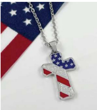
#10. Cross Necklace $10.00