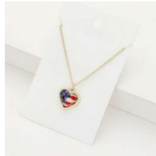
#5. Flag Necklace $10.00