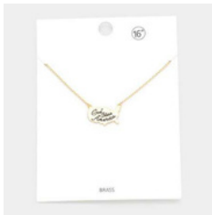
#7. God Bless America Necklace $10.00