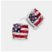
#4. Flag Stud Earrings $5.00