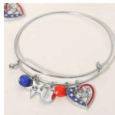
#11. Charm Bracelet $10.00