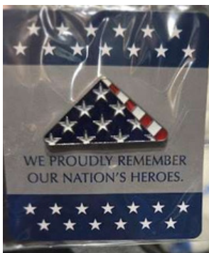
#13. Folded Flag Pin $5.00