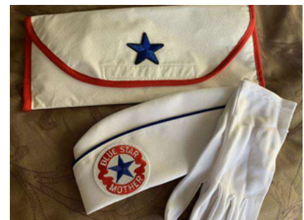
#15. Blue Star Hat Bag $10.00 (Hat & Gloves available at the National BSM Online Store)