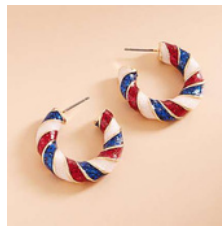
#8. Twist Earrings $10.00