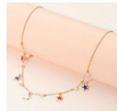
#12. Red, White & Blue Star Necklace $10.00