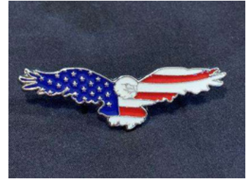
#3. Eagle Pin $10.00