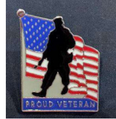
#6. Proud Veteran Pin $8.00