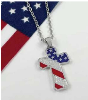
#10. Cross Necklace $10.00