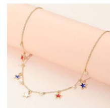
#12. Red, White & Blue Star Necklace $10.00