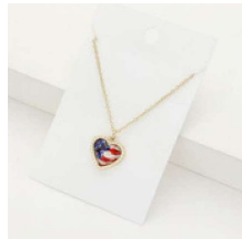
#5. Flag Necklace $10.00