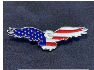
#3. Eagle Pin $10.00