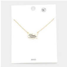
#7. God Bless America Necklace $10.00