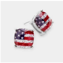
#4. Flag Stud Earrings $5.00