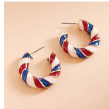
#8. Twist Earrings $10.00