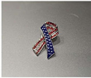
#19. Flag Ribbon $10.00