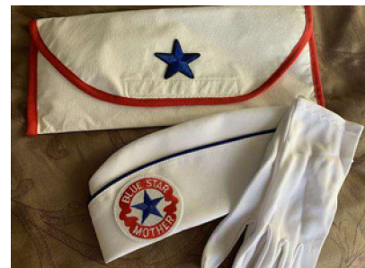
#15. Blue Star Hat Bag $10.00 (Hat & Gloves available at the National BSM Online Store)