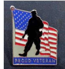
#6. Proud Veteran Pin $8.00