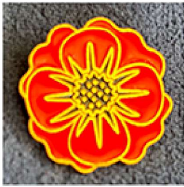
#18. Poppy Pin $5.00