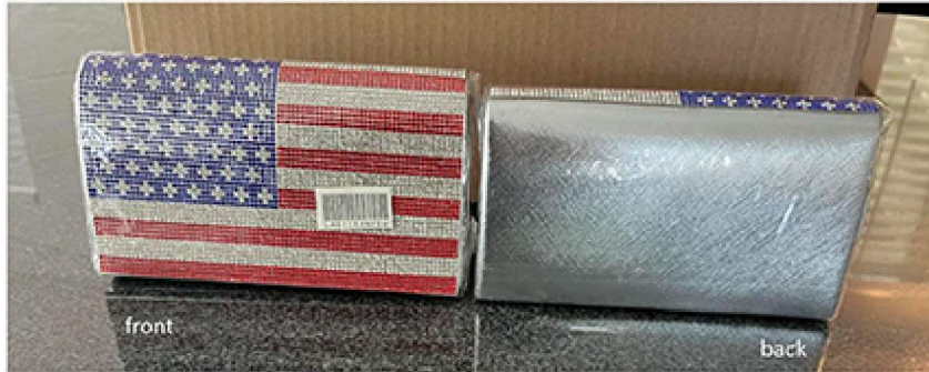
#21. Bling Evening Clutch $25.00