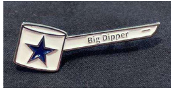
#2. Big Dipper Lapel Pin $12.00