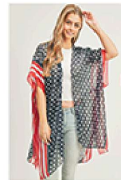
#25. Stars & Stripes