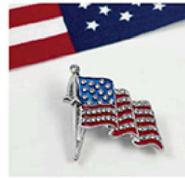
#20. Sparkly Flag Pin $5.00