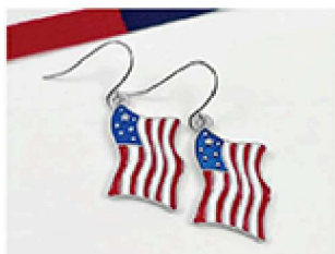
#26. Flag Earrings $10.00