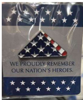
#13. Folded Flag Pin $5.00