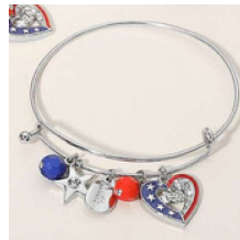
#11. Charm Bracelet $10.00